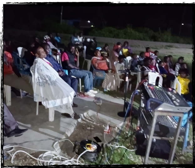
Sharing to fisherman villages outside at night

I was speaking to one of my new pastor friends on a WhatsApp phone call (overseas), and he had just broken his computer while trying to do a video training for seven of his pastor friends. Amen! I called because he had texted me that information, and sure enough, he was driving to the nearest town to get the computer fixed to be able to get back to the pastors and show the videos the next day. After hearing him out, I let him know that God through me would purchase a projector, a computer, and a screen for him. He was elated! So much so that he was rubbing the top of his head with one of his hands, smiling broadly and laughing while saying that he would be able to train pastors and bring the projector out to the fisherman and preach to them outside, he would be able to... then he broke down into tears... He wept so long that he said he would call me back later. (They ended up with 35 people, over 80% of them pastors in the next few days in that church congregation!)